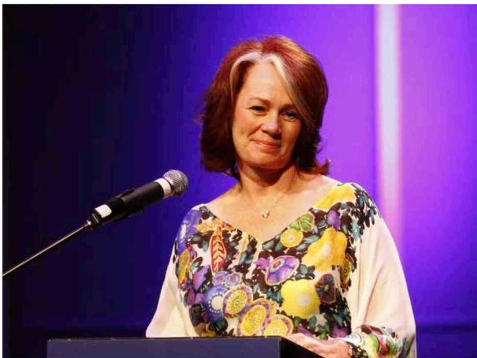
Arlene Dickinson believes entrepreneurs need much better from the federal government.