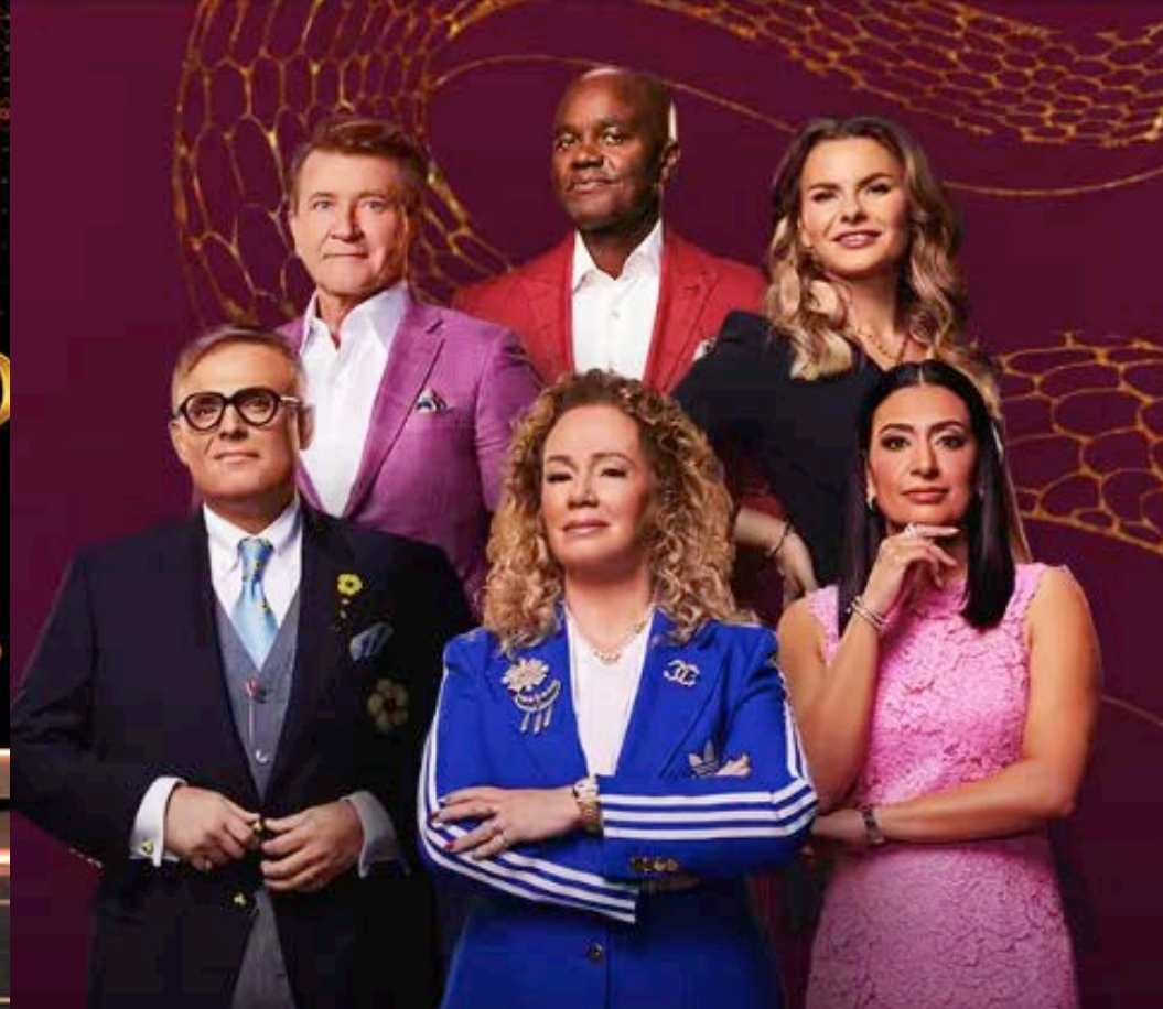
Arlene has been a fan favourite on Dragons' Den since joining the cast in season two.